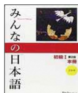
Basic Level I