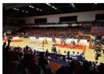
The Niigata ALBIREX Basketball Team playing at the arena of City Hall Plaza - Aôre Nagaoka, its home court