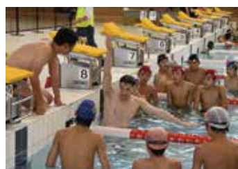
A swimming class offered by the Australian swimming team