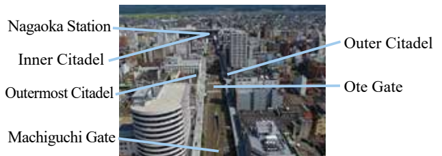
Features of the former castle site

Besides the inner, outer, and outermost citadels, the castle had a three-story structure called “ osangai ” (about 23 meters high), 9 watchtowers, and 17 gates. During the Boshin Civil War of 1868, Nagaoka Castle fell to the New Government Forces and was burned out. In 1898, Nagaoka Station was built at the former castle site when Hokuetsu Railway Inc. started operations.