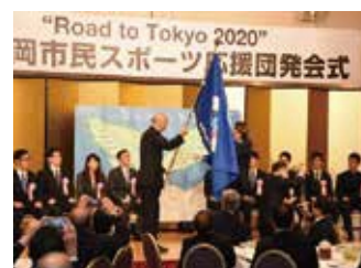
The Inauguration Ceremony of the Nagaoka Citizens' Sports Cheering Group