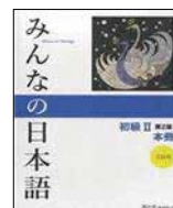
Basic Level II