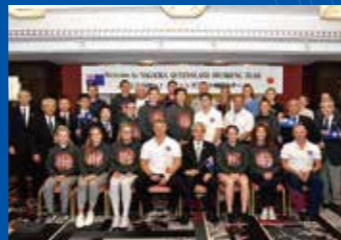
May 17, 2017