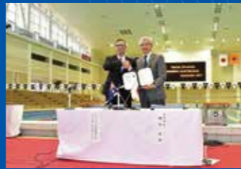
March 28, 2017