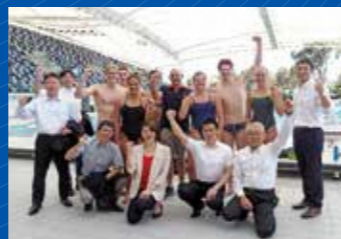
November 22, 2017