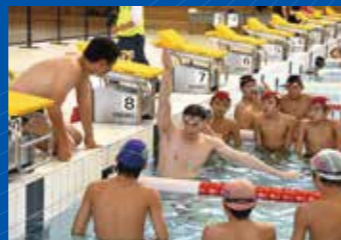
October 14, 2017