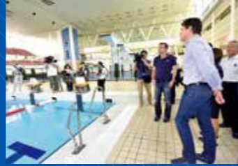
May 24, 2016

The City of Nagaoka will welcome members from the Australian National Swimming Team for their training camp in preparation for the Tokyo Paralympic Games from August 8 to 20.